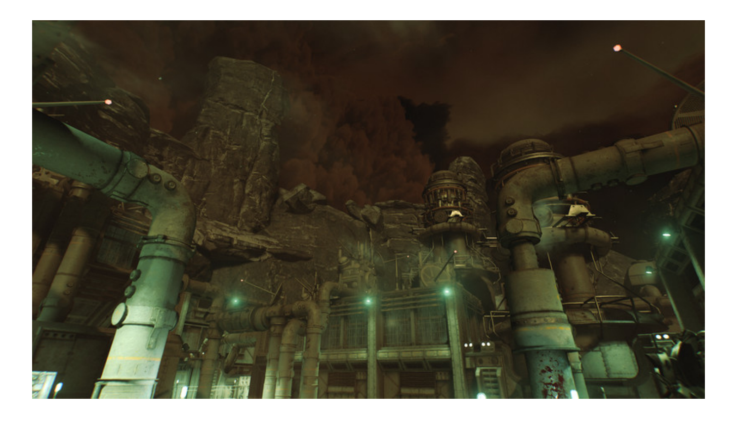
Wolfenstein II: The Freedom Chronicles - Episode 1 Activation Code [Keygen]

Download ->>->> <a href="http://bit.ly/2SRDavG">http://bit.ly/2SRDavG</a>