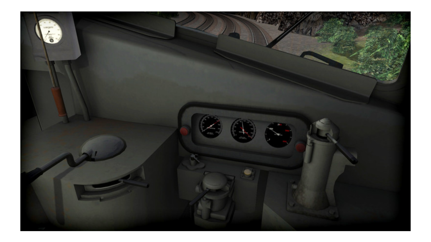
Download >>> <a href="http://bit.ly/2SJHhtJ">http://bit.ly/2SJHhtJ</a>

Train Simulator: PRR RF-16 'Sharknose' Loco Add-On Activation Code [serial Number]